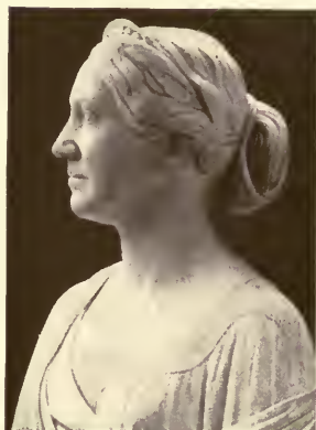
MRS. LOUISA S. McCORD.